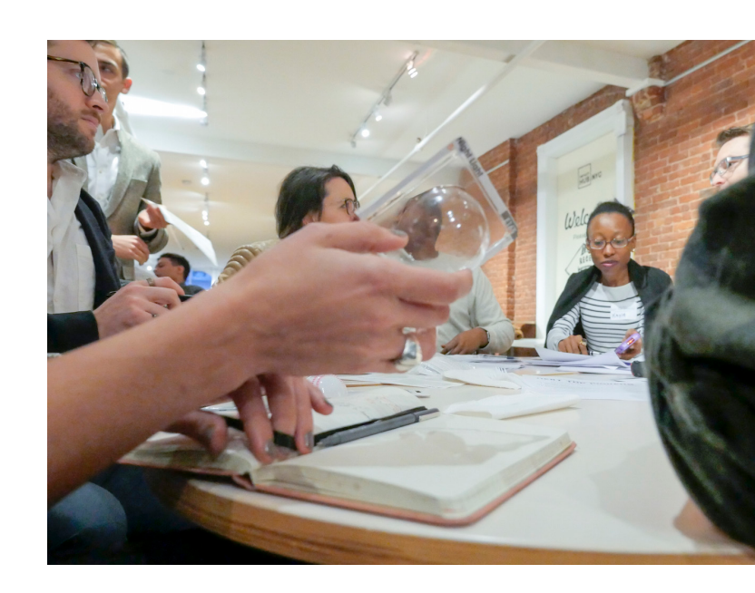
Participants in the April 2016 Design for Manufacturing workshop take apart an everyday object to understand the complexity that goes into making a physical product.

Lead for Next Top Makers. "I think that was probably the most work that we did, but it seemed to have the most impact, because the people that showed up reflected the people who stood in front of them." These efforts have paid off; 41 percent of community workshop series mentors were women or people of color, and of the 150 entrepreneurs who attended the series, 55 percent were women or people of color.