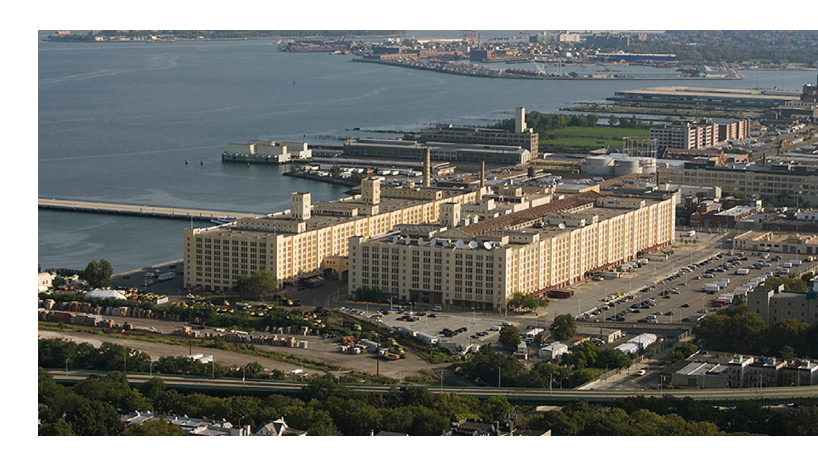
Built in 1919, Brooklyn Army Terminal in Sunset Park, Brooklyn is now home to over 100 companies in diverse industries such as bioscience, food, fashion and electronics.