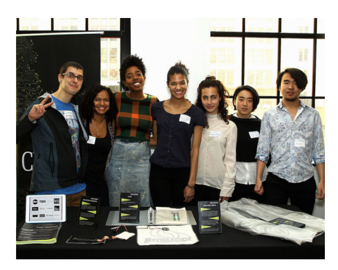
The team from The Crated, a 2015-16 Next Top Maker finalist, present some examples of their work at the Next Top Makers closing showcase. The team specializes in working with companies to integrate technology into textiles with a focus on design and supply chain integration.

In order to integrate the equity measures into the manufacturing portfolio of the industrial action plan, NYCEDC had to first assemble a measurement and evaluation system that places equity indicators in the context of their programs and goals.